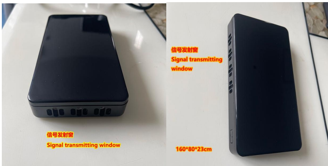
PB-1 录音屏蔽器摆放说明 PB-1 recording jammer placement instructions

只需将任意发射窗一侧对准需要屏蔽的人即可（原则上优先使用 4 窗口的一侧）。 Just point any side of the launch window to the person who needs to be shielded (in principle, the side of the 4 window is preferred)