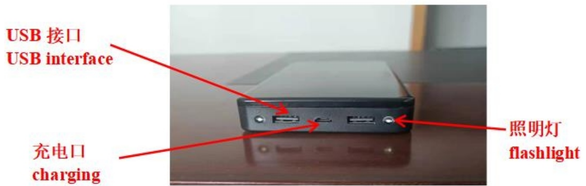
图 4 Figure 4