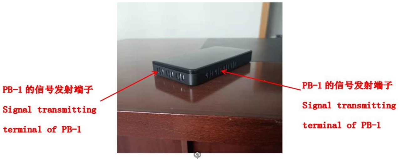
图 1 Figure 1