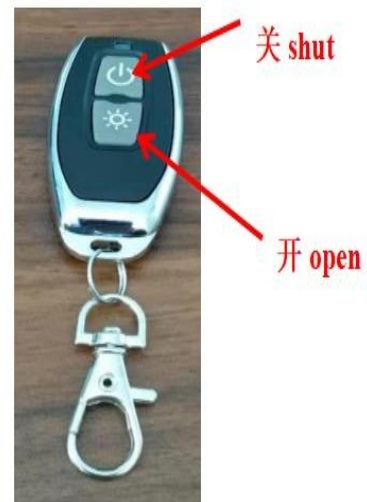
图 3 Figure 3