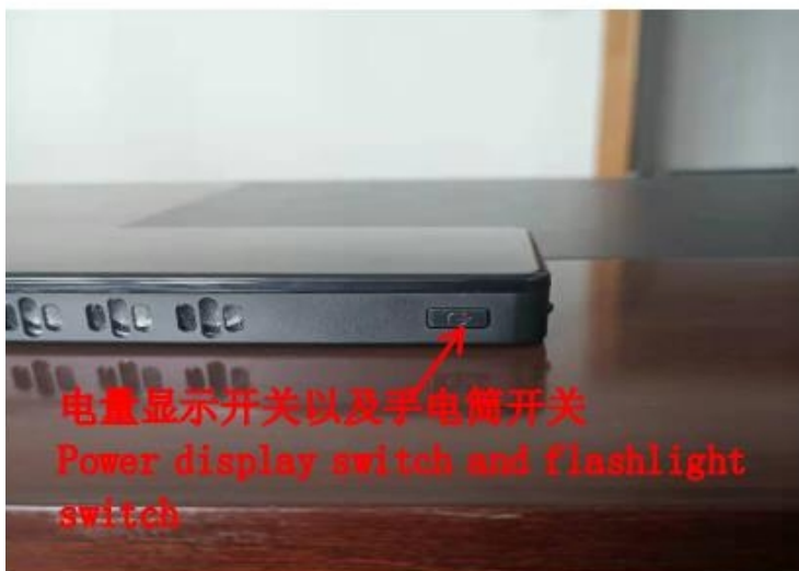
图 2 Figure 2