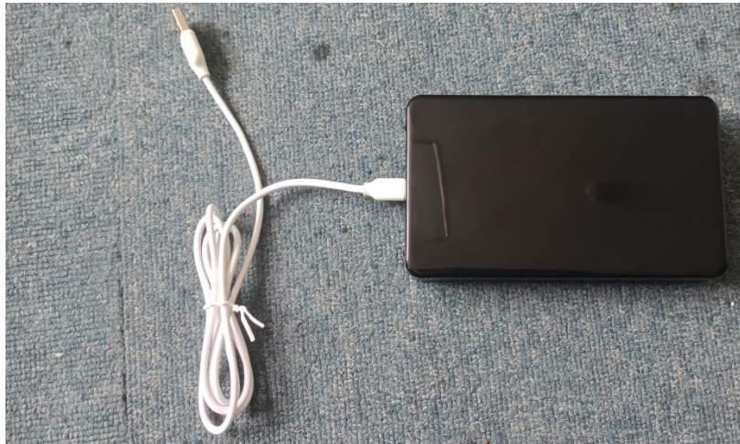
图 6 Figure 6

(1) 设备充电，任意 5V 充电器（手机充电器）搭配数据线即可充电。充电时充电指示灯 100% 并且不再闪烁时表示充电完毕（参考图 5）。