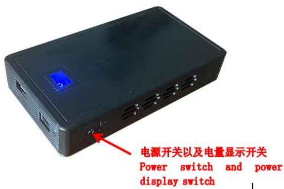
图 2 Figure 2