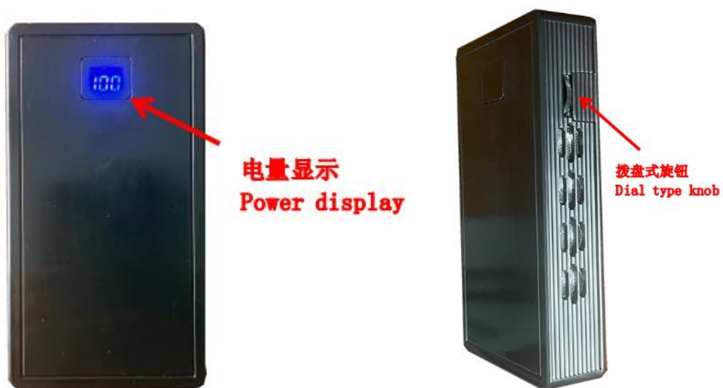
图 5 Figure 5