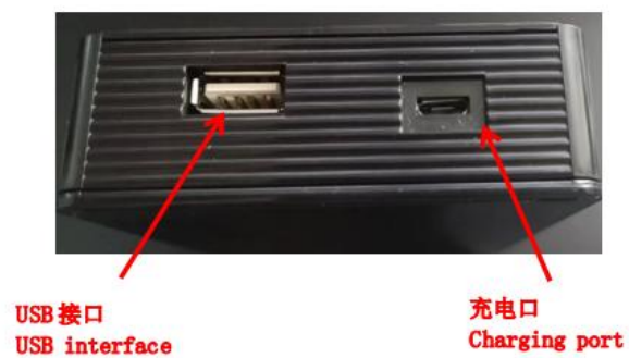
图 4 Figure 4