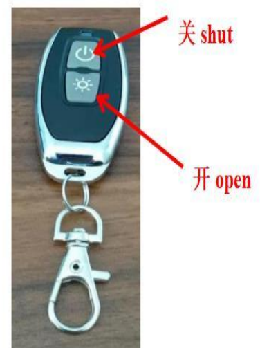
图 3 Figure 3